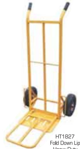
HT1827 Fold Down Lip Heavy Duty