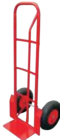
HT2401 Large Pneumatic Wheels