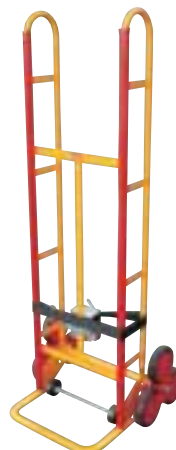
HT1500 Stair Climber