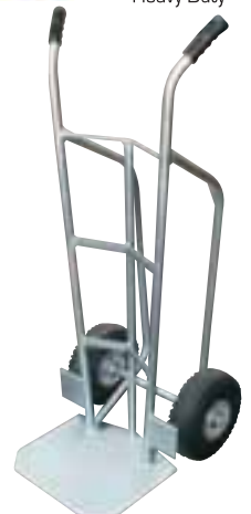
HTS-HD Heavy Duty, Solid Lip