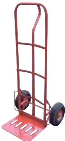
HT1821 Heavy Duty Construction