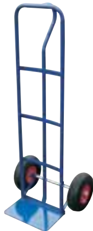
HT1805 General Purpose