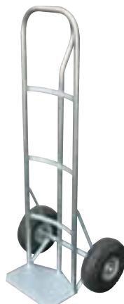
HTT1805-Z Heavy Duty Zinc Plated